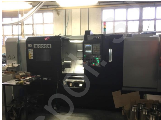
CNC lathe ECOCA MT-415MC