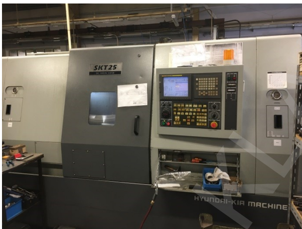
CNC lathe HYUNDAI-KIA SKT 25