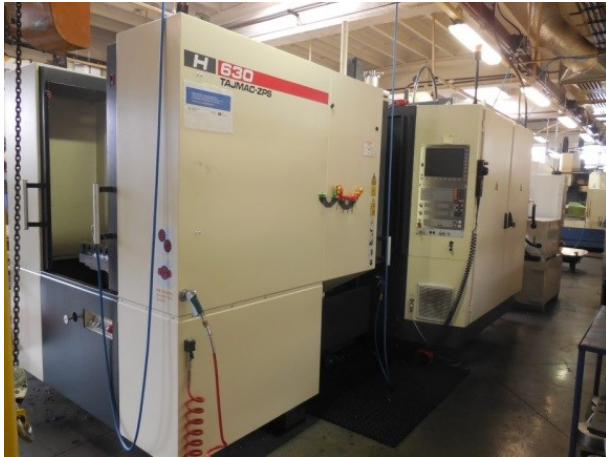
CNC machining center ZPS Tajmac H 630